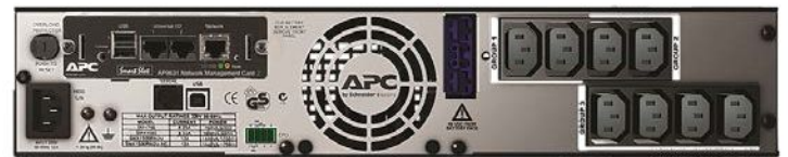
[ SMX1500RM12UNC ]