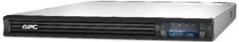
[ SMT1500RM11U ]