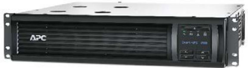
[ SMT1500RM12U ]