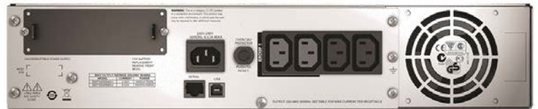
[ SMT1500RM12U ]