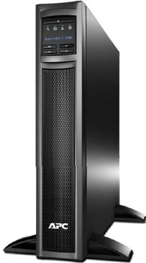
[ SMX1500RM12U ]

Convertible extended run models ideal for critical servers and voice/data switches.