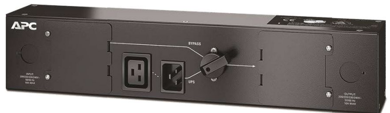
[ SBP3000RM ]

SBP3000RMHW: APC Service Bypass Panel, 100 - 240 V; 30 AMP ; BBM; Hard-wire Input/Output