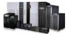
Delta offers a full range of UPS solutions from 600 VA to 4000 kVA to fulfill your power security needs.

HPH-B: UPS integrated battery model has batteries inside HPH-BN: UPS integrated battery model has no batteries inside