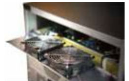
Redundant fan design enhances system reliability*