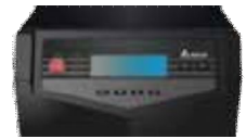
Control and LCD Display Panel