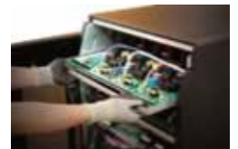
Swappable interior architecture for quick and easy maintenance*