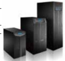
High power performance HPH series UPS